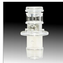
Male Quick Connect with 3/8" Hose Barb