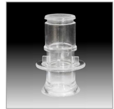
Male Plug for 1/2" Hose Barb Female Connector