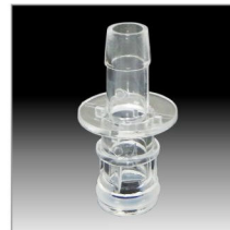
1/4" Male Connector