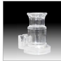
Female Plug for 1/2" Hose Barb Male Connector