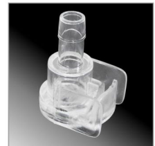
1/4" Female Connector