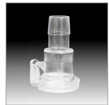
1/2" Hose Barb Female Connector