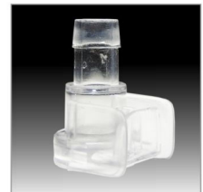
Female Quick Connect with 3/8" Hose Barb