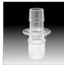
1/2" Hose Barb Male Connector