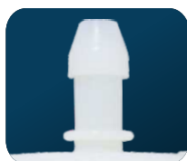
1/2" Single Stepped Hose Barb