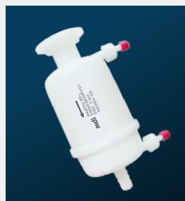
1 1/2" Sanitary Flange to 1/2" Barb Hose

mdi AseptiCap® WL/WS filters are available in a wide range of end connections and are also customized to offer different inlet-outlet combinations to meet the unique connectivity needs in biopharmaceutical process assemblies where, for example, stainless steel components with sanitary flange connections are sometimes required to be connected to single use disposable systems through quick-connectors or hose barb connections.