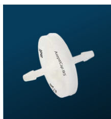
AseptiCap ® WL/WS 25mm, 5cm 2

mdi provides complete documentation for each of the AseptiCap ® WL/WS filters there by reducing the additional validation cost and time.