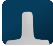
Male Luer Slip