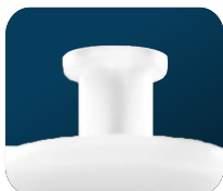
3/4" Sanitary Flange