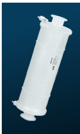
AseptiCap ® WL/WS 10", 6000cm 2