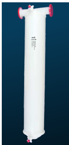
AseptiCap ® WL/WS 30", 18000cm 2