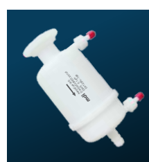
AseptiCap ® WL/WS 5", 1000cm 2