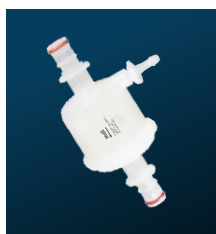
AseptiCap ® WL/WS 1", 250cm 2