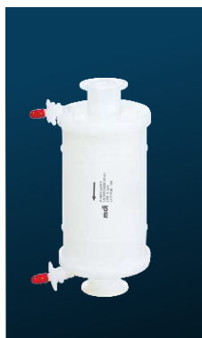
AseptiCap ® WL/WS 5", 3000cm 2