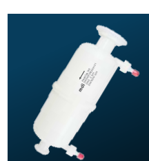
AseptiCap ® WL/WS 8", 2000cm 2