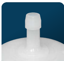
3/8" Hose Barb