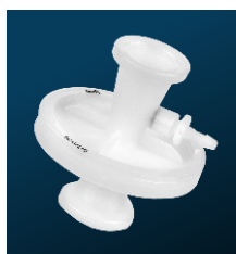
AseptiCap ® WL/WS 50mm, 20cm 2