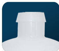
1" Hose Barb