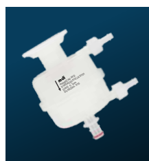
AseptiCap ® WL/WS 2", 500cm 2