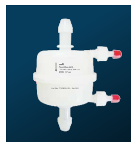
AseptiCap® with HighSecurity 1/2" hose barb connection