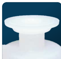
1 1/2" Sanitary Flange