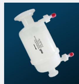
1 1/2" Sanitary Flange to 3/4" Sanitary Flange