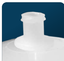
Female Luer Lock